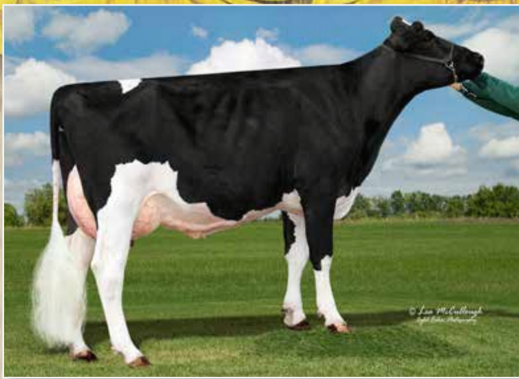
Anyking GW Atwood 792 Dam of Lot 68